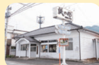
Ichikawa Washi Processors Cooperative Associations