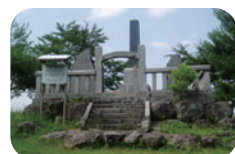
Historic site of Kai-Genji