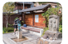
Chuhoku no Idobata