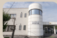
Insho Shiryokan (Museum of Seal Stamp)

☎0556-32-2159 2160 Iwama, Ichikawamisato Town Weekdays: 9:30~17:00 Weekends: 10:00~15:00 ※ Closed on Saturdays, Sundays, and Holidays from December to March.