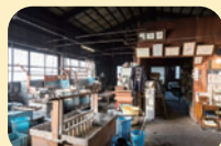
Toyokawa Paper Mill. Hands-on experience is available.

Please contact / The Ichikawamisato Town Chamber of Commerce and Industry ☎055-272-4711 (Weekdays 9:00~16:30)