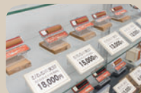
Seals can be purchased at the museum.