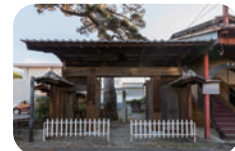
Remains of Ichikawa-jinya