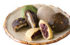
Anbin rice cake