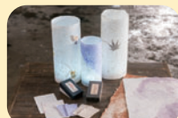
Hand-made Washi products