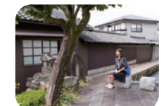
Kakinoki no Tsuji